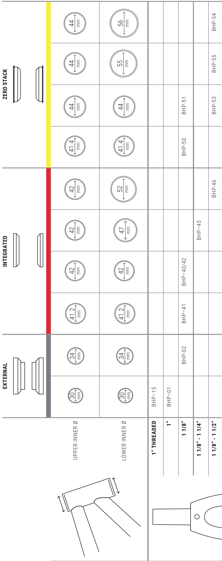
1. MEASURE INNER Ø